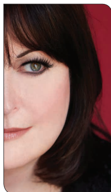
Ann Hampton Callaway

On December 6, the dynamic vocalist/pianist, Ann Hampton Callaway will prove her Diva Power . As a champion of the great American Songbook, Callaway's made her mark in the music world as a singer, pianist, composer, lyricist, arranger, actress, educator, TV host and producer. Callaway's live performances showcase her warmth, spontaneous wit and passionate delivery of standards, jazz classics and originals. Her unique style has made her a mainstay in concert halls, theaters and jazz clubs as well as in the recording studio, on television, and in film. She is best known for her Tony-nominated performance in the hit Broadway musical Swing! and for writing and singing the theme song to the hit TV series The Nanny . Ann's latest recordings, The Sarah Vaughan Project: Live at Dizzy's in 2014 and The Hope of Christmas in 2015 have enjoyed great critical acclaim. In addition to her many recordings, she has also been a guest performer on more than forty CD's including Kenny Barron's latest CD The Traveler .