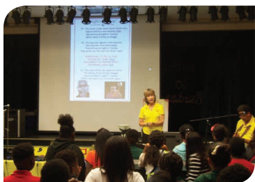
JazzSLAM at Markham Elementary

JazzSLAM is provided for free for the individual school and students. In order to provide this program at no cost, we must secure local support from grants and individuals. Bravo to those who support this program. If you would like more information or contribute to this program, just call the GCJS office at 954-524-0805.