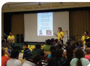
JazzSLAM at Davie Elementary